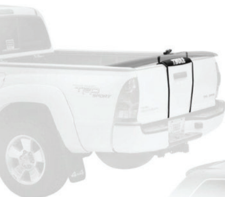
Surf Tailgate Pad

Finally, with the Double Decker carrying two boards is easier than ever. Designed to carry a wide range of surfboards sizes one atop the other, Double Decker is an intelligent (it shares many of the design features of the Taxi) solution to secure and stable – not to mention stylish – transportation.